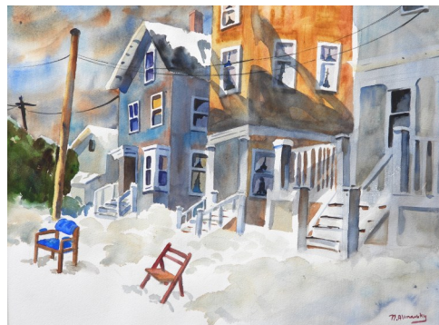
Reserved Parking, Jamaica Plain