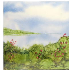
6 " tile