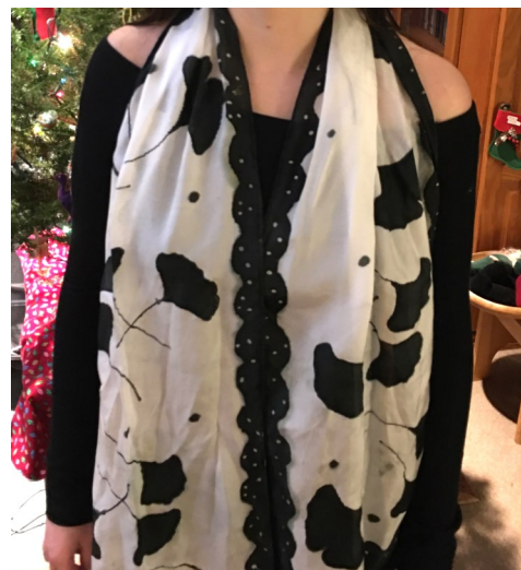
Black and white ginkgo scarf