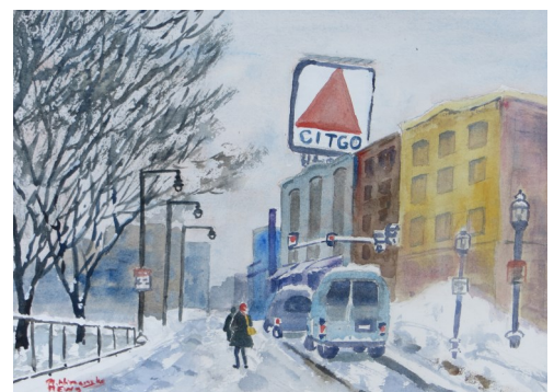
No Baseball Today