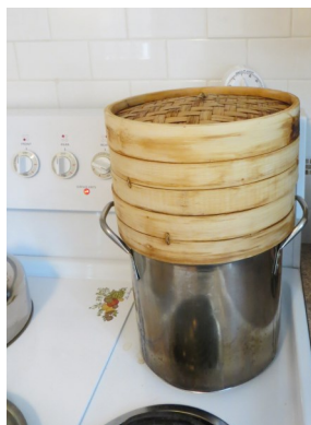
On the stove

I then steam the scarf for about 3 hours. After I remove it from the steamer I carefully wash off any excess dye and iron the finished scarf.