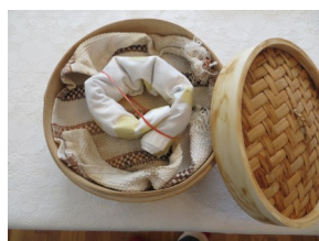
Wrapped and ready to steam

Next I steam the scarf to set the color. I wrap it very carefully and place it in a bamboo steamer.